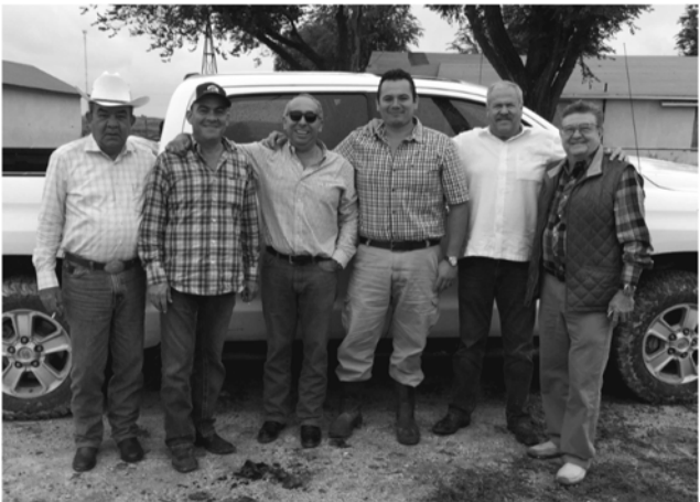
Friends from Mexico

Comments: Heifer bull prospect. Top 1% of the breed for Calving Ease and BW.