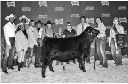
Grand Champion Brangus Heifer at the 2017 Arizona National Livestock Show