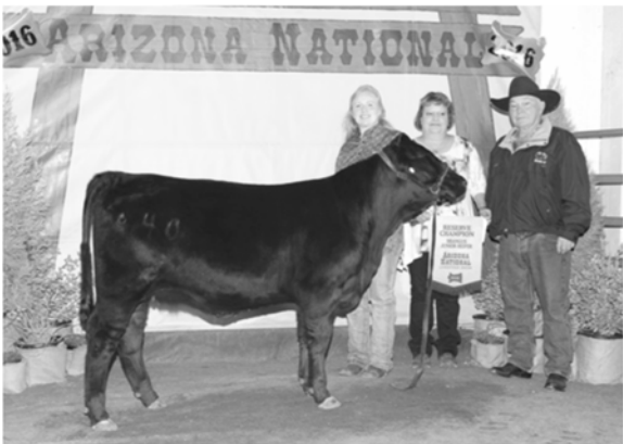
Reserve Champion Junior Heifer Alex Dees Memorial Brangus Show Arizona National 2016