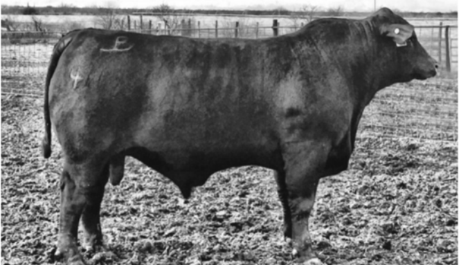
Reserve Champion Bull 2016 Roswell Brangus Sale

Comments: Heavy made bull. Extra long with good width and lots of meat.